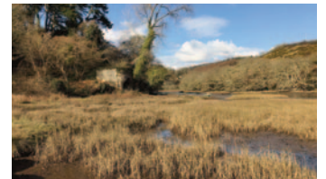
20 - Looking north from Tidal Road including Lime Kiln