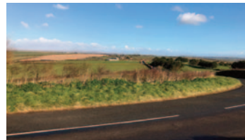
9 - From B3392 close to Golf Club looking north