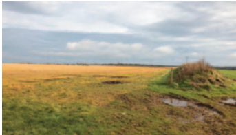
24 - Looking west from C252 north of Houghton Farm