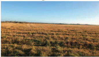
25 - Footpath to south of Waterworks, St Ann's Chapel