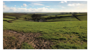
30 - Towards Tuffland Farm from B3392