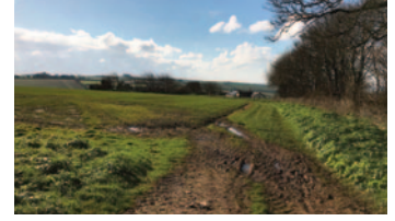
15 - Looking south from Bigbury Court