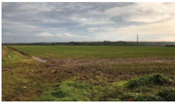
23 - SW from C252 north of Houghton Farm