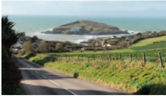
1 - Burgh Island from Folly Hill