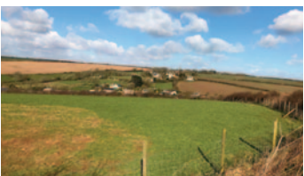
8 - Looking North from Cot Lane close to Turtle Farm