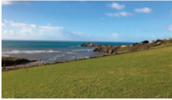
3 - Bigbury Golf Club towards Burgh Island