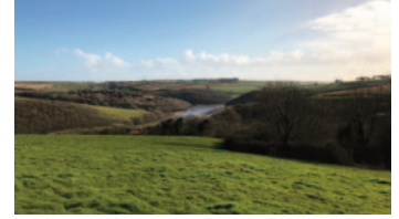
16 - Looking east from east of Doctor's Wood towards Avon Estuary