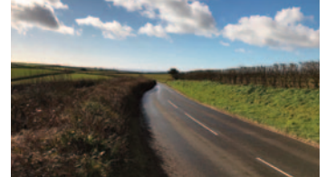
31 - Sea from B3392 south of Seven Stones Cross