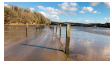
21 - Tidal Road