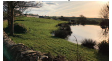
18 - Across pond to Bigbury Village