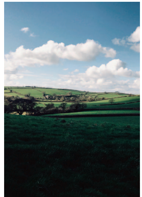
35 - From road north of parish