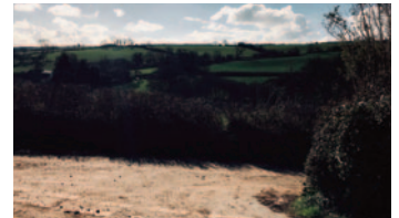
34 - To the NW from north of Shoal of Furze