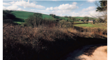
33 - Looking west towards Knowle Farm