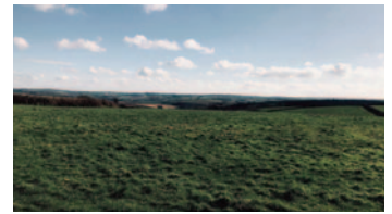
32 - Towards Dartmoor from B3392 to north of Seven Stones Cross