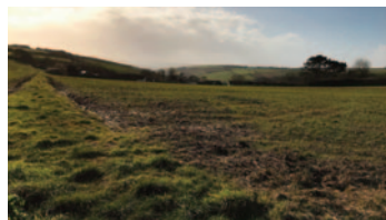
10 - from B3392 looking SE towards Challaborough