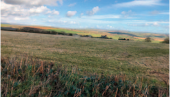
26 - From B3392 north of St Ann's Chapel towards Holwell Farm