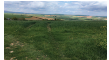
19 - Towards Dartmoor from Stakes Hill Road