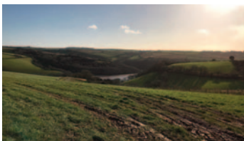
7 - Avon Estuary from New Quay Lane