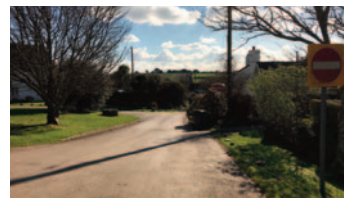
13 - South from Bigbury Green