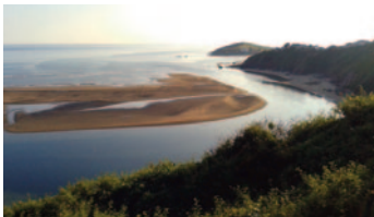
5 - Avon Estuary from footpath above Cockleridge