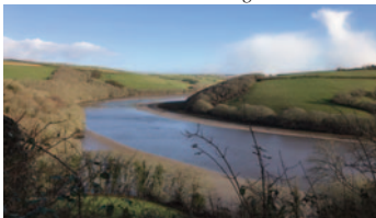
6 - Avon Estuary from New Quay Lane