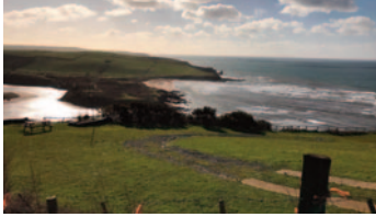
2 - Public footpath Folly Farm towards Bantham