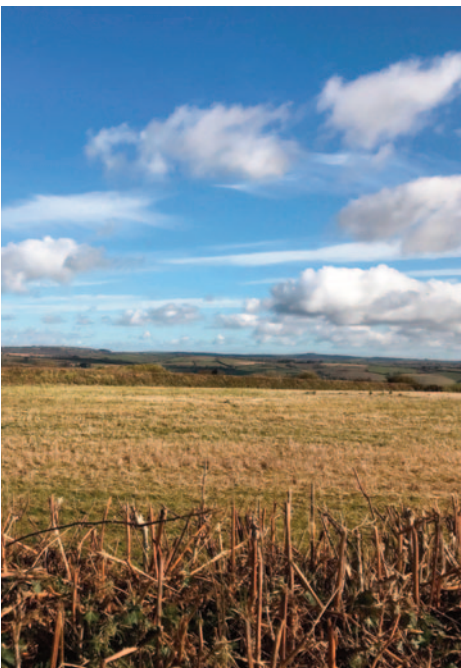
28 - Looking SW for access to Tuffland Farm south of Seven Stones Cross