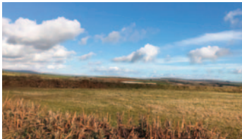
27 - Looking NW from B3392 north of St Ann's Chapel