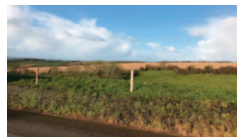
14 - From the Royal Oak PH