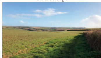
11 - Looking SW from footpath SW of Bigbury Village