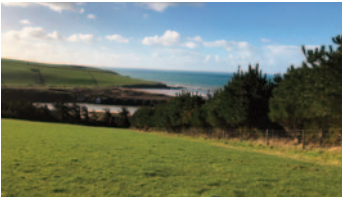
4 - Bigbury Golf Club towards Bantham