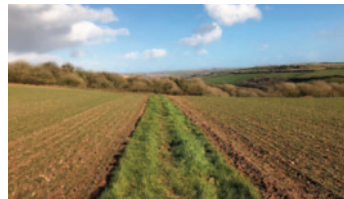
12 - Footpath 3 looking east towards Doctor's Wood and Dartmoor