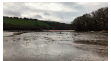
22 - Avon Estuary looking south from Tidal Road