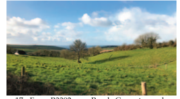
17 - From B3392 near Ponds Green towards Challaborough