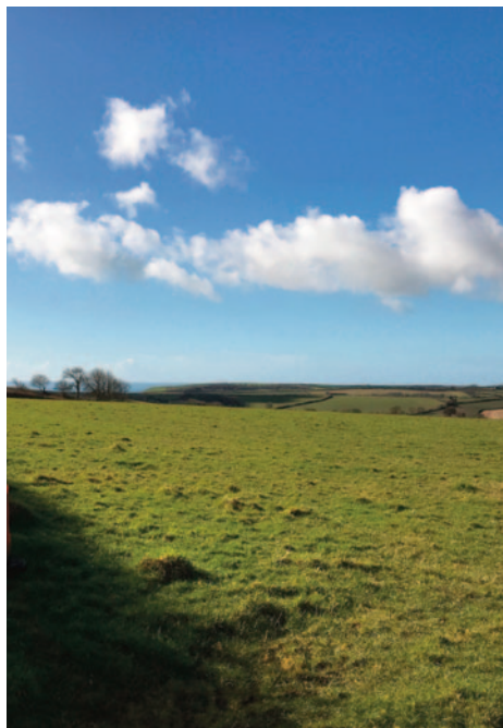
29 - Sea from north end of Blackberry Lane